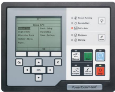
3.X / 3300 Control Board