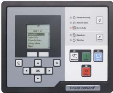
2.X / 2300 Control Board